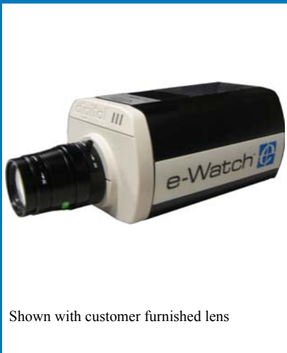
Shown with customer furnished lens